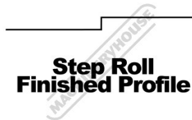
Step Roll Finished Profile