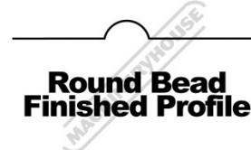
Round Bead Finished Profile