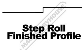
Step Roll Finished Profile