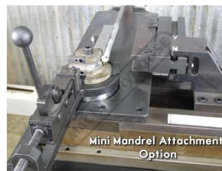
Optional Mini Mandrel Attachment