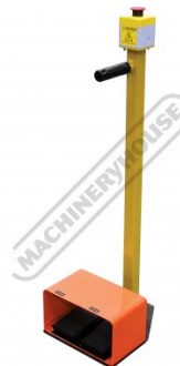
Foot Control Emergency Stop