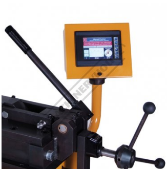
Quick Release Counter Die System