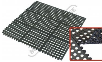
M805 Rubber Mat - Anti-Fatigue