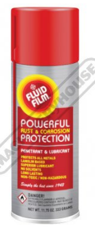
O040 Rust & Corrosion Preventive - Penetrant & Lubrication