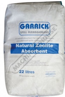
O000A Natural Zeolite Absorbent