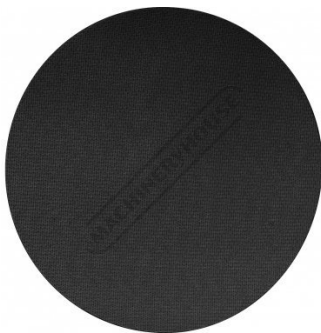
A0700 178mm (7") Hook & Loop Backing Disc