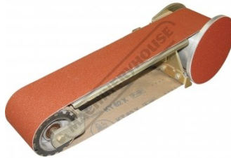
L090 Multitool Belt & Disc Linishing Attachment