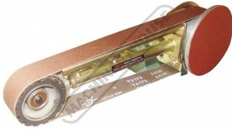
L088 Multitool Belt & Disc Linishing Attachment