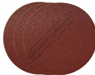
A5334 100G x 178mm (7") Aluminium Oxide Sanding Disc Pack