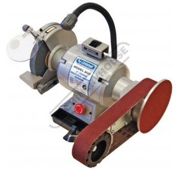
G156 Industrial Bench Grinder with Linisher