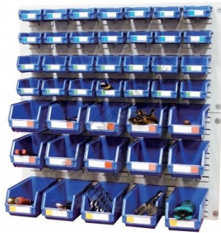
Shown with Optional Buckets and Tools