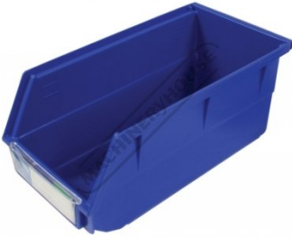
A436 Plastic Bucket