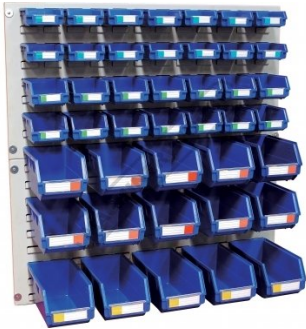
Shown with Optional Buckets on Panels