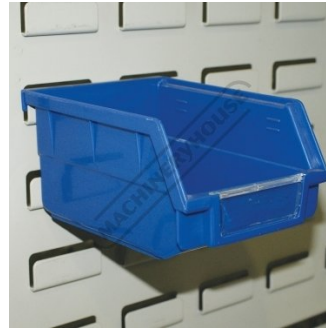
Shown with Optional Buckets