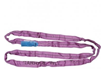
H305 Round Sling