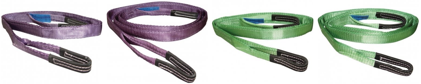
H324 Flat Sling