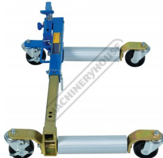
Side View Extended