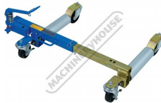
Right Side Extended