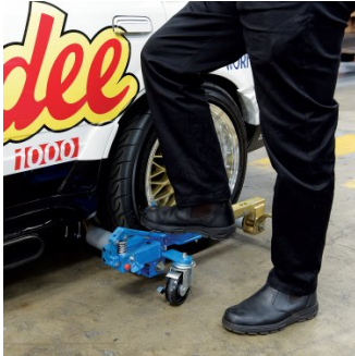
Hydraulic Foot Pump To Lift Vehicle

sales@machineryhouse.com.au www.machineryhouse.com.au