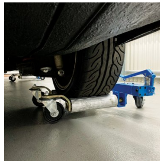
Vehicle Lifted Left Side View