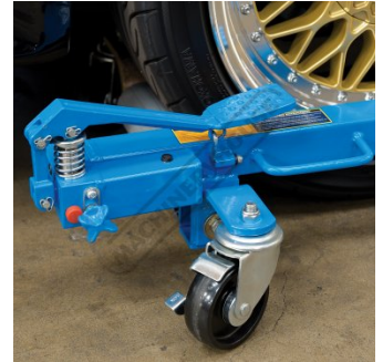
Foot Pedal Secured In Down Position