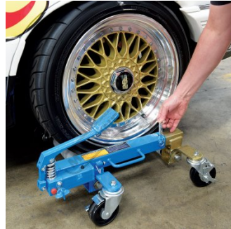
Inserting Safety Lock Pin