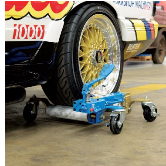
Wheels Jacked Ready to Move Vehicle