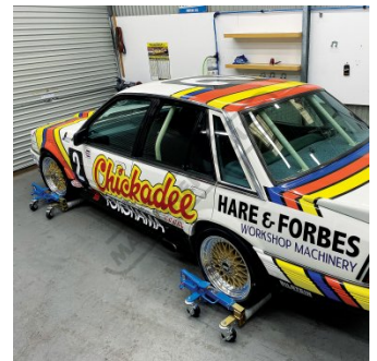
Vehicle on Jacks Ready to Move