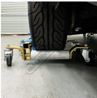
Vehicle Lifted Right Side View