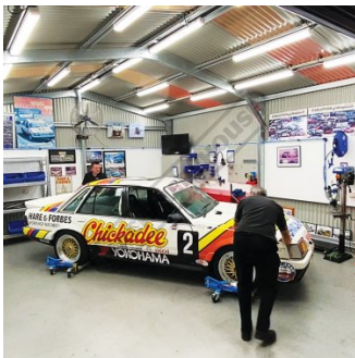
Moving Vehicle Into Position