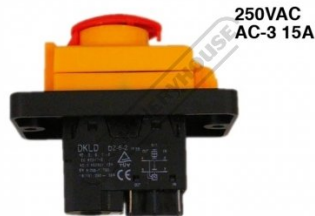
2BC0226 Switch 250V Lid Open