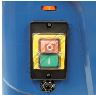
Speed Dial and Switch