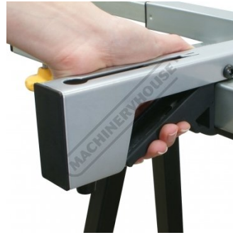
Quick Release Clamp