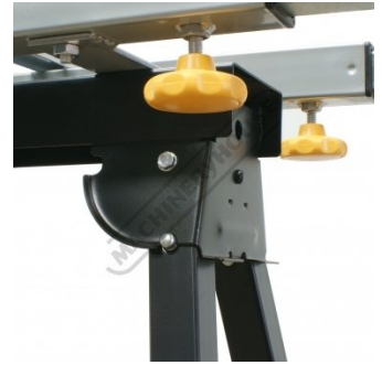
Fold Up Legs For Storage