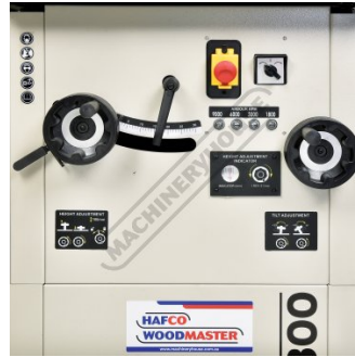
Spindle Adjustment Controls