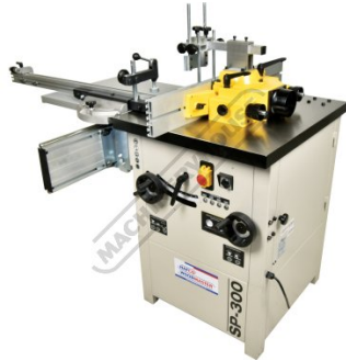
Sliding Table with Mitre Guide and Top Clamp