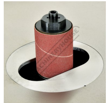
Sanding Sleeve Attachment