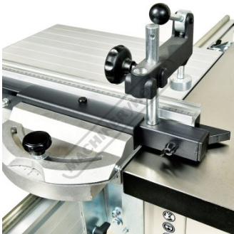
Includes Mitre Guide