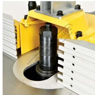
Tilting Arbor to 30 Degrees