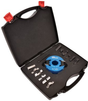
W647 40mm Multi Profile Spindle Cutter Head Set