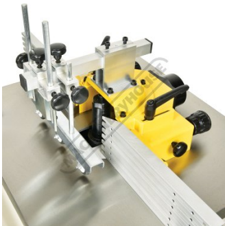
Cutter Guard with Dust Chute