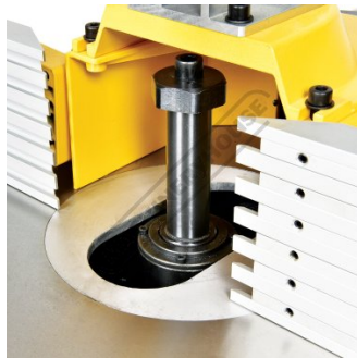
30mm Cutter Head