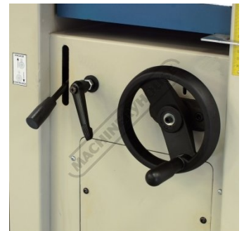
Thicknesser Table and Controls