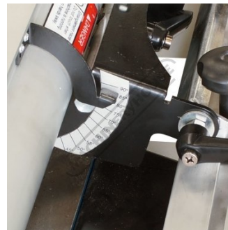
Adjustable Tilting Fence Scale