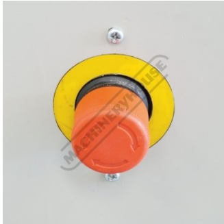
Safety Stop Switch