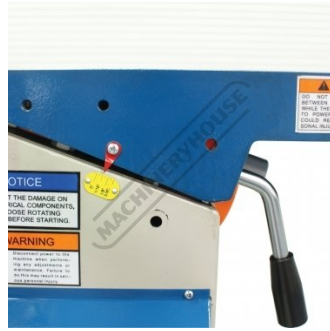
Table Height Gauge