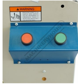
On Off Buttons