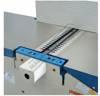
4 Blades Cutter Head