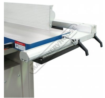
Adjustable Double Lock Fence