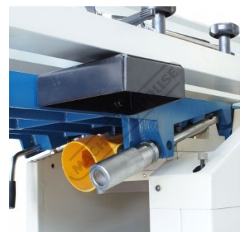
Table Height Adjustment