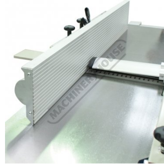
Aluminium Extrusion Fence