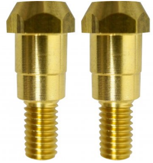
W557 2 Contact Tip Holders