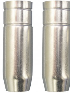
W535 2 x Conical Nozzles