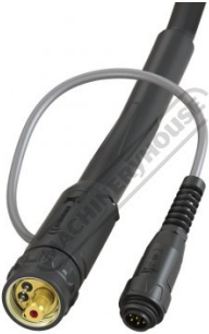
Euro Connector with 4 Pin Plug