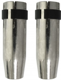
W555 2 x Conical Nozzles