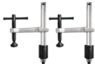
W08512 Weld Clamps with Locking Nuts (2 Piece Pack)