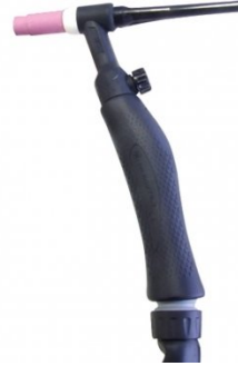
W171D Air Cooled TIG Welding Torch