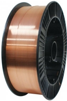
W135 Ø0.9mm Mild Steel MIG Welding Wire