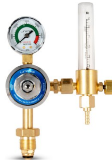
W161 Argon Gas Regulator-Bobbin Flowmeter