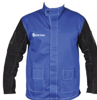
W1002A Professional Promax BL7 Welding Jacket