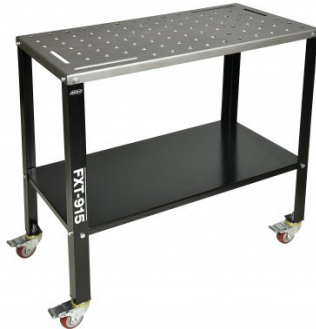
W08450 FIXTURE TABLE