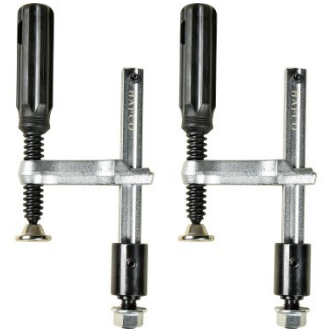
W08510 Weld Clamps with Locking Nuts (2 Piece Pack)