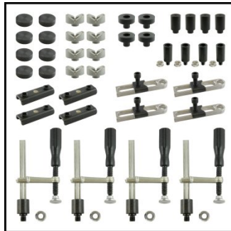
W08500 40pc Square & Round Welding Table Clamp Kit