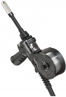
W181C Spool Gun - Light Duty