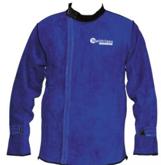
W1002A Professional Promax BL7 Welding Jacket