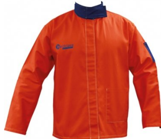
W1000A Promax HV5 Welding Jacket