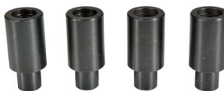
W08515 38mm x M12 Multi-Purpose Riser/Stops (Spigot Type) - 4pc Pack