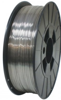
W145B Ø0.8mm Gasless Mild Steel MIG Welding Wire