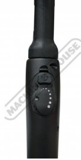
Amperage Control Dial and On Off Button