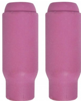
W588 2 x Long Back Caps