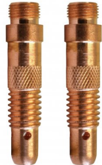
W594 2 x 2.4mm Collet Holders