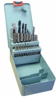
T019 Metric HSS Hand Tap & Drill Set - 29 Piece