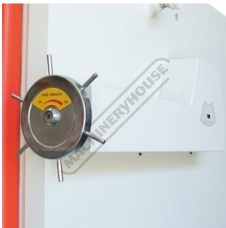
Blade Clearance Adjustment Handle