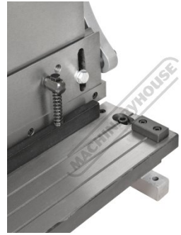
Metal Shearing Clamp