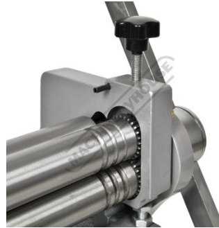
Wire Grooves-Gear Drive