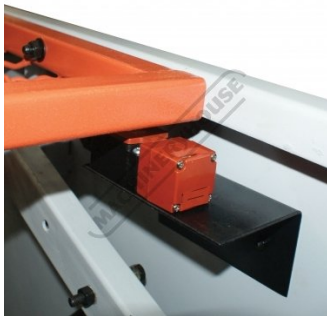
Safety Micro Switch on Rear Gate