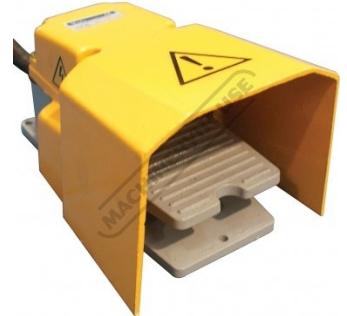
Industrial Roving Foot Pedal