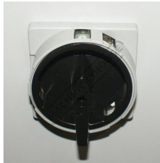
Main Isolation Switch