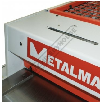
Material Viewing Windows