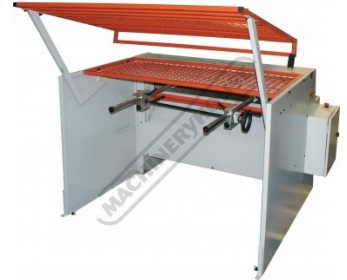
Hinged Rear Gate with Gas Strut Support