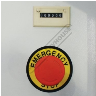
Emergency Stop and Cut Counter