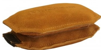
S214 Rectangle Leather Bag - Steel Shot Filled