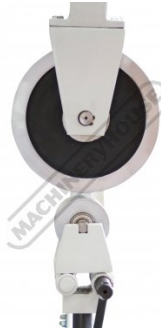
Front View Of Wheels