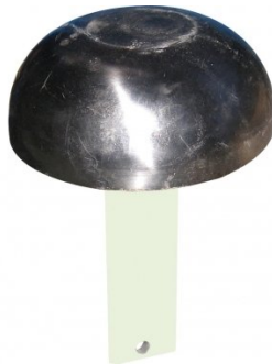
S2237 Bowl Steel Dome Dolly