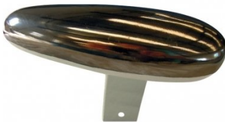
S2236 Oval Steel Dolly