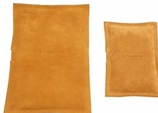
S212 Rectangle Leather Bags - Sand Filled