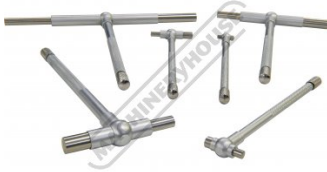
6 Piece Set