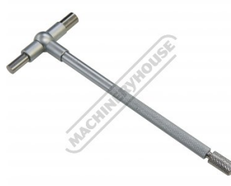
Knurled Handle Grip & Lock