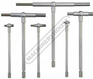
Metric & Imperial Comparator