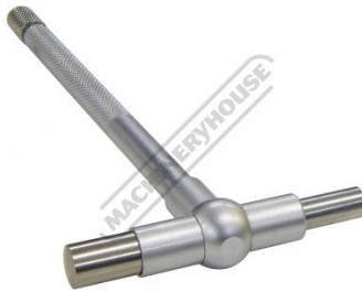
Spring Loaded Adjustable Movement