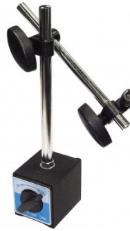
M050 Magnetic Base - Standard