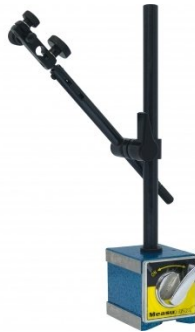
Q435 Magnetic Base - Large