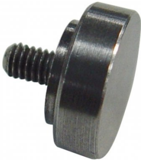
Q2165 Ø10mm Flat Contact for Dial Indicators