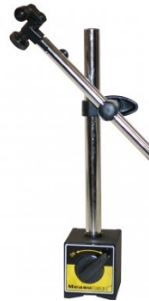
Q4351 Magnetic Base - Large