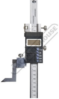
Display & Controls