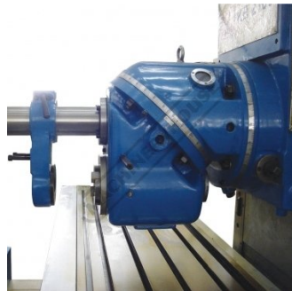
Horizontal Attachment Side View