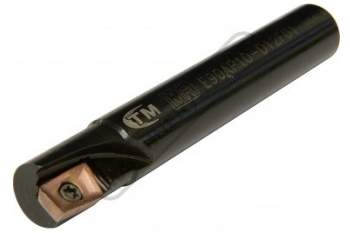
12mm End Mill