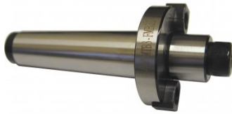
M562 Face Mill Arbor