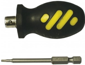
ML412 Cutter Part - Wrench