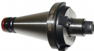
M550 Face Mill Arbor