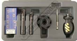
Top View In Case