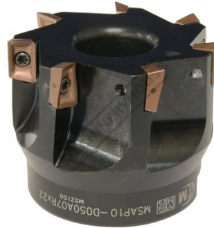
50mm Face Mill