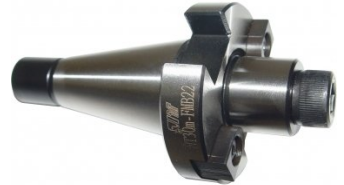
M540 Face Mill Arbor