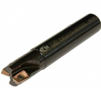
16mm End Mill