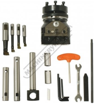
Set shown out of Case