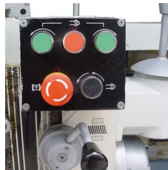
Electro magnetic control switch