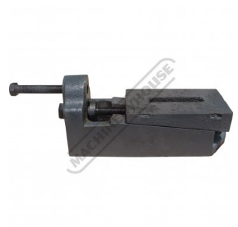
Mounting feet pads