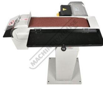
Side View With Lid Open