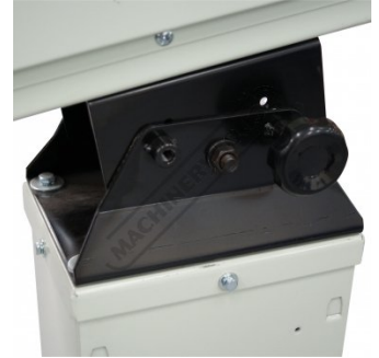
Head Tilt Adjustment