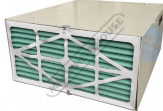
5 Micron Outer Paper Filter