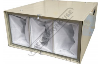
1 Micron Inner Fabric Bag Filter