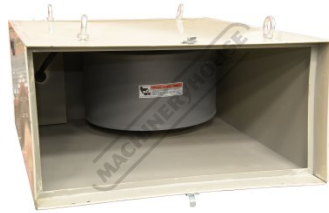
Shown with Filters Removed