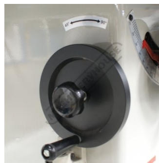
Tilt Arbor to 45 degrees