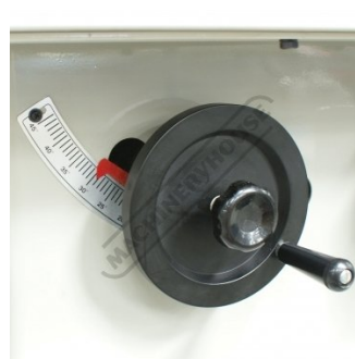
Blade Height Adjustment Handle and Angle Scale