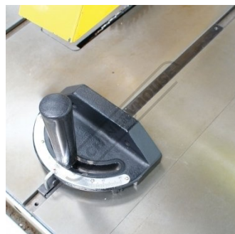
Heavy Duty Mitre Guide 60 degrees