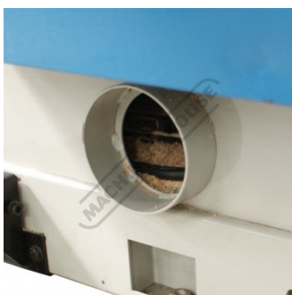
100mm Dust Chute