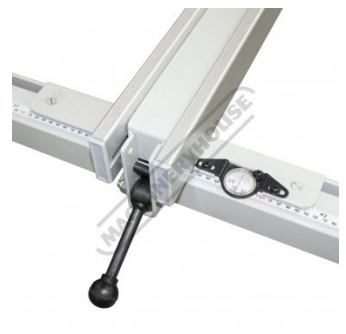
Single Lock Lever on Rip Fence with Magnified Scale