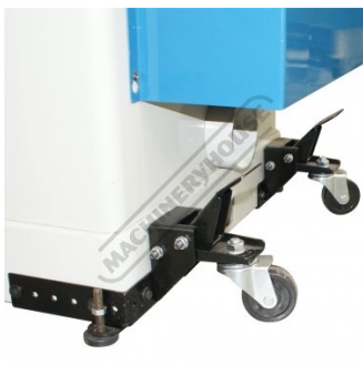
Swivel Wheels on Mobile Base with Leveling Screws