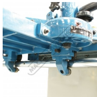
Heavy Duty Ball Bearing Table Slides