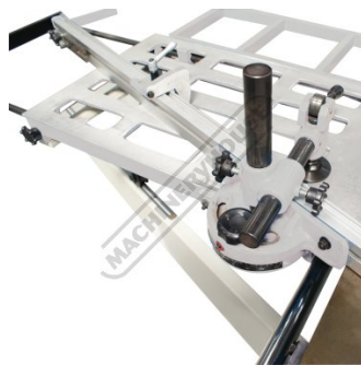
Sliding Table with Mitre Guide and Material Clamp