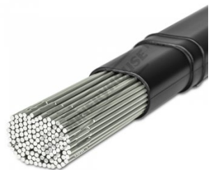
AT5356-1.6 - \varnothing 1.6 mm TIG Filler Rod - Aluminium