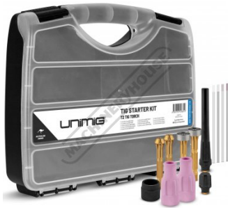
T2 Tig Torch Consumable Pack