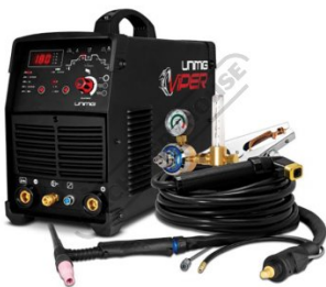
VIPER™ TIG 180 AC/DC TIG/STICK Kit