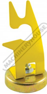
Magnetic TIG Torch Rest