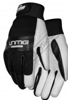
ROGUE™ TIG Welding Gloves