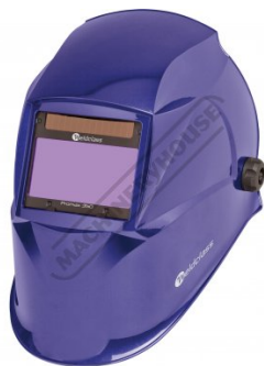
PROMAX 350 - Auto Darken Welding Helmet - 9-13 Shade