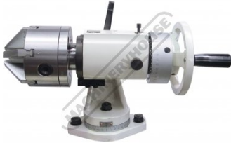
Drill Grinding Attachment