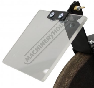
Adjustable Eye Shields