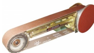
L089 Multitool Belt & Disc Linishing Attachment