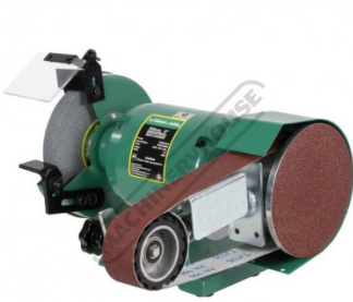
AA362W8 Abbott & Ashby Grinder & Linisher