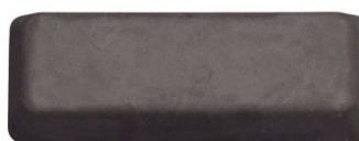
G323 Grey Buffing Compound