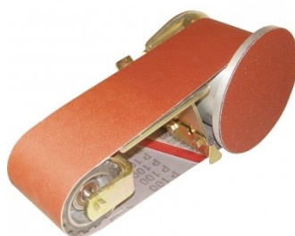
L088 Multitool Belt & Disc Linishing Attachment