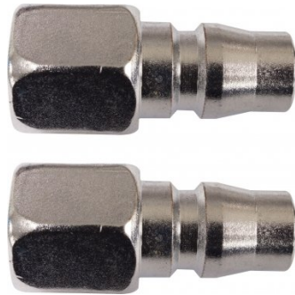
F955 High-Flow Air Fittings