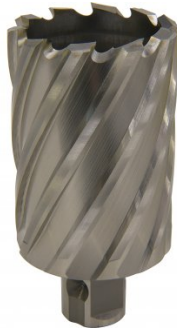
D9580 HSS Drill Broach Cutter