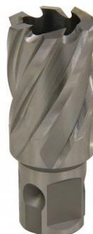
D9524 HSS Drill Broach Cutter