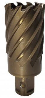
D935A HSS-Co (5% Cobalt) Drill Broach Cutter