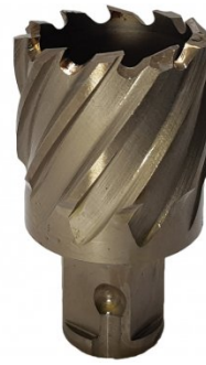
D935 HSS-Co (5% Cobalt) Drill Broach Cutter