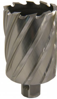
D9582 HSS Drill Broach Cutter