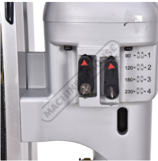
Four Speed Gearbox