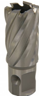
D9522 HSS Drill Broach Cutter