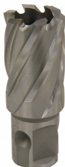
D9523 HSS Drill Broach Cutter