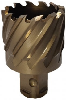
D940 HSS-Co (5% Cobalt) Drill Broach Cutter