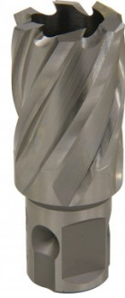
D9524 HSS Drill Broach Cutter