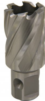
D9526 HSS Drill Broach Cutter