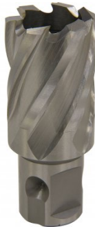
D9525 HSS Drill Broach Cutter