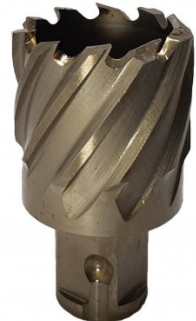
D934 HSS-Co (5% Cobalt) Drill Broach Cutter