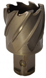
D932 HSS-Co (5% Cobalt) Drill Broach Cutter