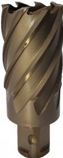
D932A HSS-Co (5% Cobalt) Drill Broach Cutter