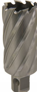
D9572 HSS Drill Broach Cutter