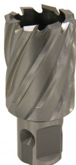
D9528 HSS Drill Broach Cutter