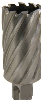
D9574 HSS Drill Broach Cutter