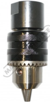
Includes Drill Chuck