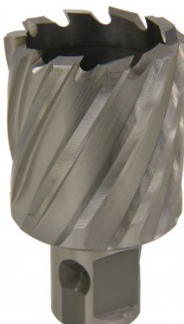
D9535 HSS Drill Broach Cutter