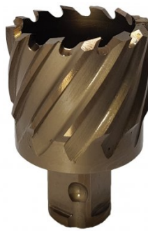
D940 HSS-Co (5% Cobalt) Drill Broach Cutter