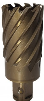
D934A HSS-Co (5% Cobalt) Drill Broach Cutter