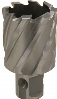
D9534 HSS Drill Broach Cutter