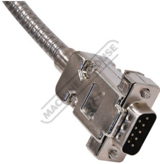
Dsub 9 Male Plug