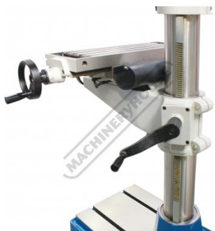
Rack and Pinion Wind Up Table