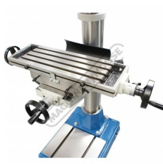
T Slotted Work Table