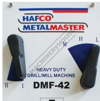
Gear Selection Levers