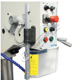
Interlocked Spindle Safety Guard