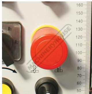
Emergency Stop Switch and Overload Protection