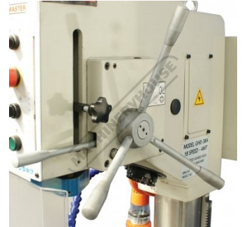
Adjustable accurate depth setting with auto feed out for increased productivity