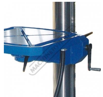
Rack and pinion wind up Table