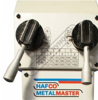
Gear Selection Levers