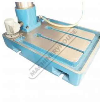
T Slotted Base