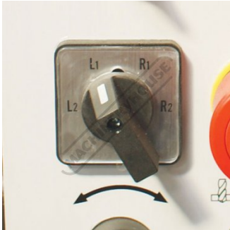
High Low with Forward and Reverse Switch