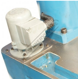
Coolant Pump System