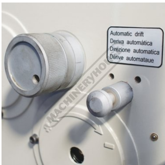
Automatic Feed Range and Auto Drift Drill Ejector