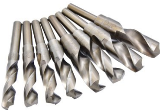
D1181 Imperial Industrial HSS Reduced Shank Drill Set