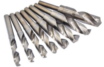
D1171 Metric Industrial HSS Reduced Shank Drill Set