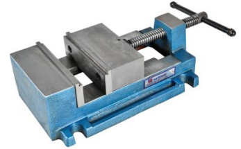
V142 Safeway Precision Drill Press Vice