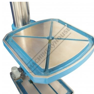
T Slotted Work Table