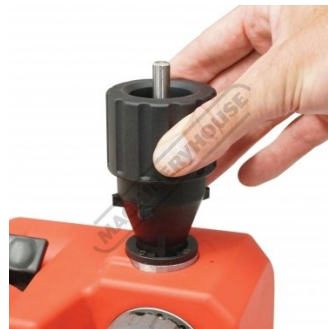
Facing the Back Angle Operation