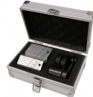
Aluminium Storage Case