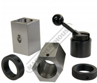
Square, Hexagonal Holders & Collet Clamp