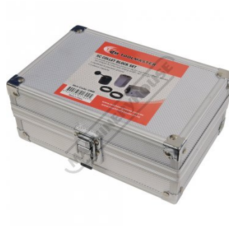
Aluminium Storage Case Closed