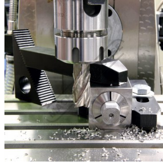
Shown Used with Square Holder