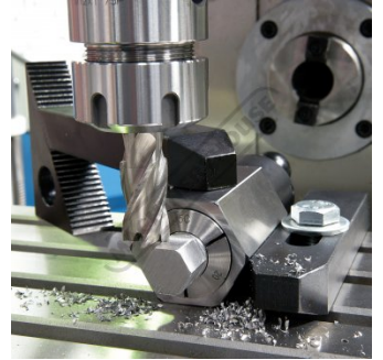
Shown Used with Hexagonal Holder