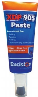
S075 Cutting Tool Lubricant Paste - 200g