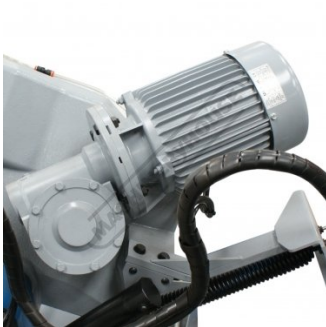
Motor and Gearbox Drive