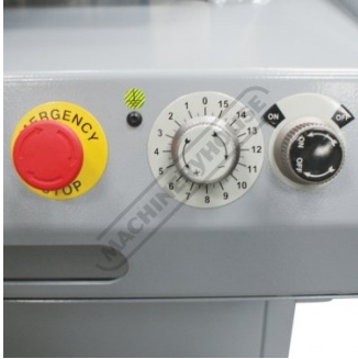
Adjustable Automatic Feed