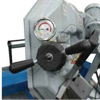
Blade Tension Gauge