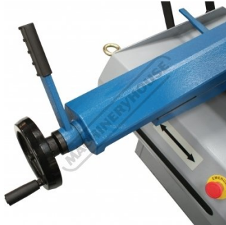
Quick Action Clamp Lever