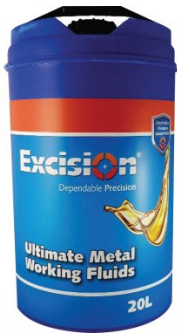
S091 Soluble Metal Cutting Fluid - 20 Litre