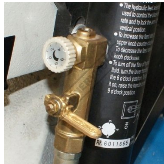
Down Feed Control