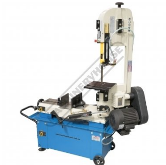
Shown Set Up with Vertical Cutting Table