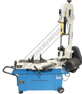
Head Fully Raised