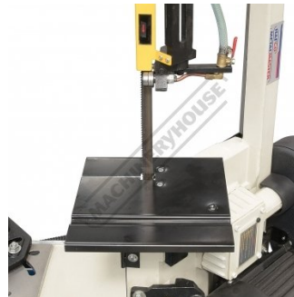
Vertical Cutting Table