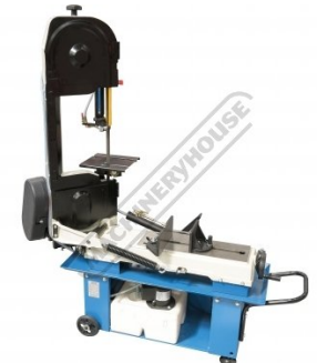
Shown Set Up with Vertical Cutting Table Rear View