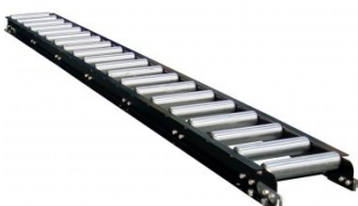
L812 Roller Conveyor